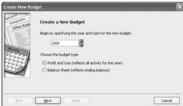
1: You can create a budget for any upcoming fiscal year.